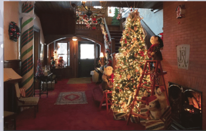
Florissante, The Mansion Lyons Falls, NY