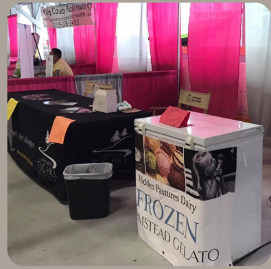
HIDDEN PASTURES DAIRY - SELLING THEIR GOAT MILK GELATO!

We would like to thank all our Members who shared our booth with us! And we hope you were able to visit our Members while they were tabling at the booth. Our Members who joined us during Fair Week were: