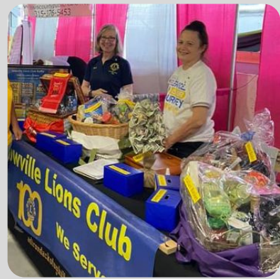
HIDDEN PASTURES DAIRY - SELLING THEIR GOAT MILK GELATO!