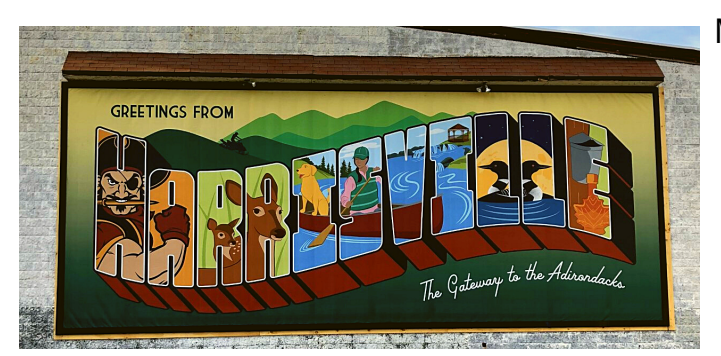
Mural installed in 2020

From the Lewis County Chamber of Commerce